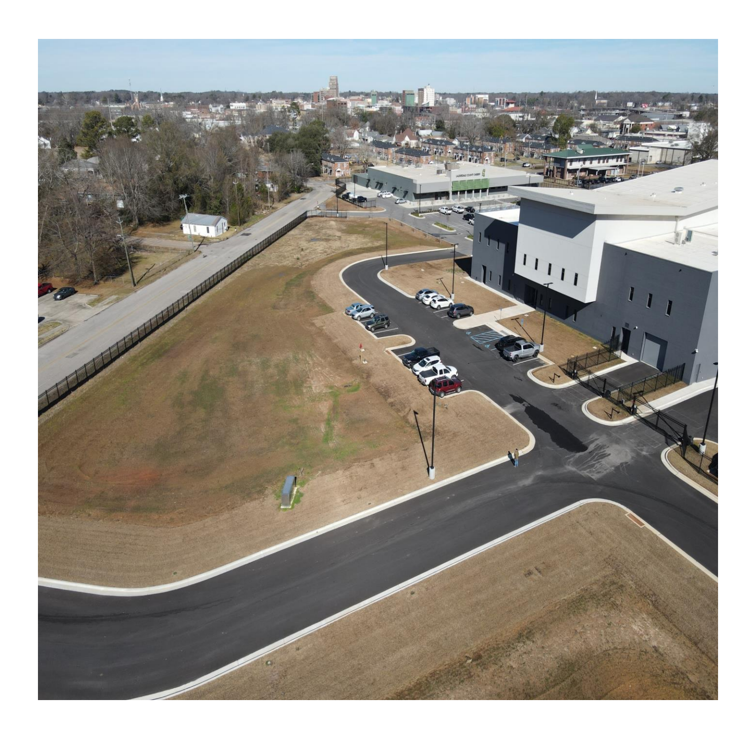
Overview of the back of the building Image 4. Considered as part of the Government Building & Entry Blvd Bid.