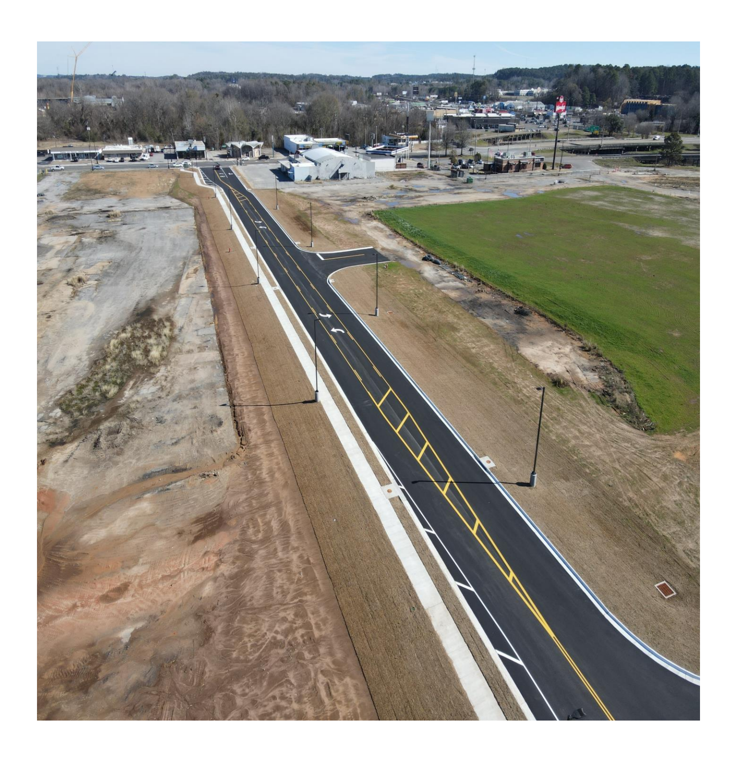
Overview of The Boulevard from 22^{\rm nd} Avenue. Considered as part of the Government Building & Entry Blvd Bid.